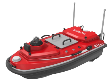
M20 pro USV Options